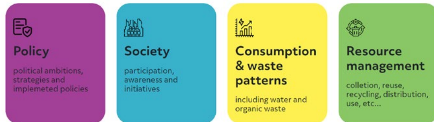
Dimensions of the Circularity Label

The tool takes the form of an online questionnaire comprising of 27 questions related to qualitative and quantitative indicators. A scoring system then dictates the circularity level of a city/region based on their responses. The HOOP Bio-Circularity Label Certificate will be awarded to cities and regions that demonstrate maturity in circular policies, programs and projects.