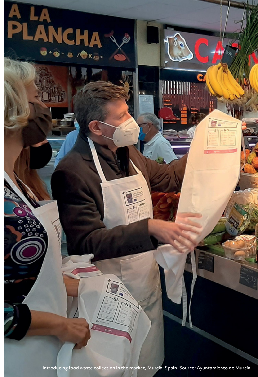
Introducing food waste collection in the market, Murcia, Spain.

Initiated within the ValueWaste project, the biopatrols have proven particularly successful and can be considered a best practice worth replicating. Trained teams were positioned in different parts of the city to engage directly with citizens. It turned out that, when speaking to the coaches face-to-face, citizens dared to ask all their questions and voice any doubts and could thus easily be taught about proper waste sorting. This was especially helpful in the first weeks of introducing the new waste sorting system. The biopatrols also managed to achieve a snow-ball effect in the information flow (e.g. from schools to parents and families, from large producers to all consumers). Since the biopatrols were in frequent and direct contact with the waste collectors, it was also possible to react directly – meaning if the biowaste collected in some streets had poor quality or quantity, the biopatrols would directly react and move their mobile stand to this street and engage with the household representatives. In summary, the biopatrols significantly contributed to obtaining a high quality of biowaste from the beginning of the changed collection system.