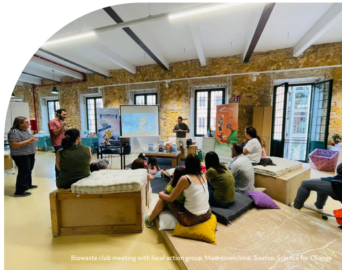
Biowaste club meeting with local action group 'Madresxelclima'.